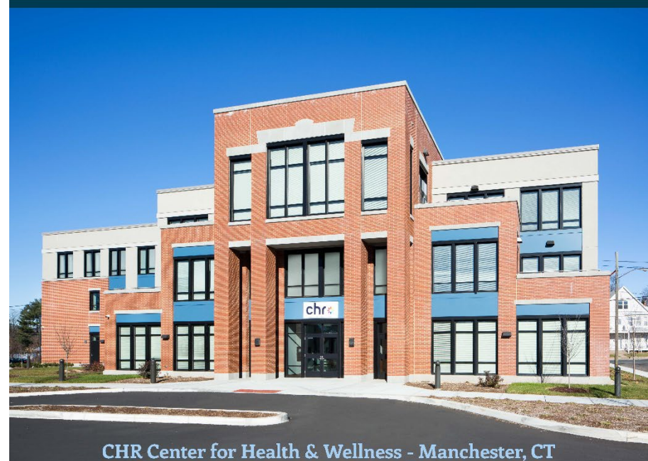
CHR Center for Health & Wellness - Manchester, CT

• We are honored to support CHR's mission of inspiring hope and transforming lives for children, families, and adults across Connecticut.