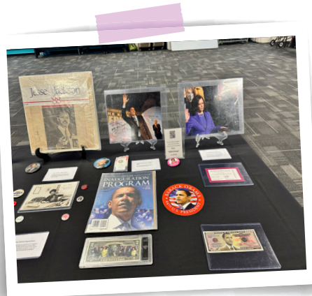
The True Black History Museum Exhibit