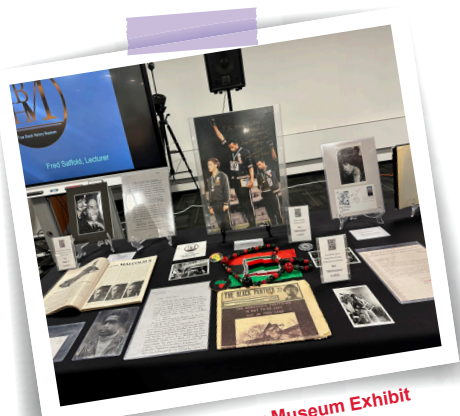
The True Black History Museum Exhibit

Throughout the month of February, CHR celebrated Black History Month. Here are a few snapshots of our celebrations.