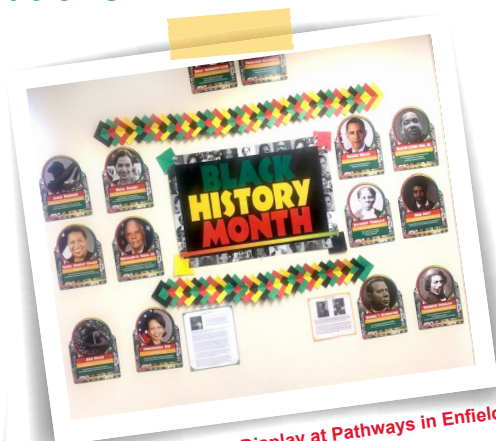
Black History Month Display at Pathways in Enfield